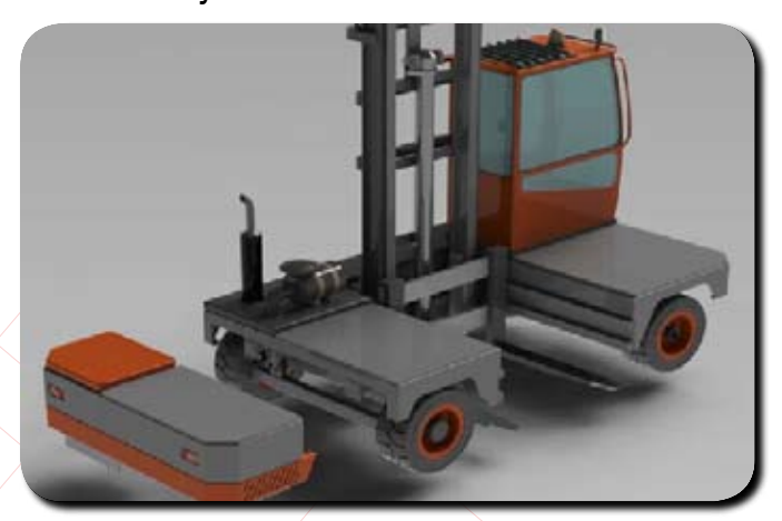
Modular Design SL Series