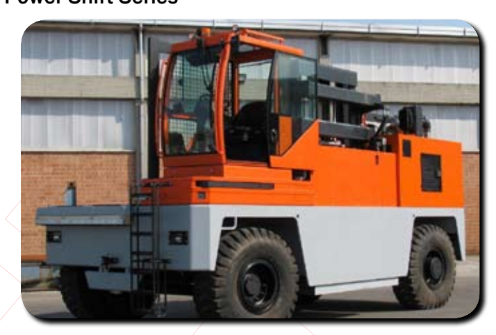
Compact Design Option