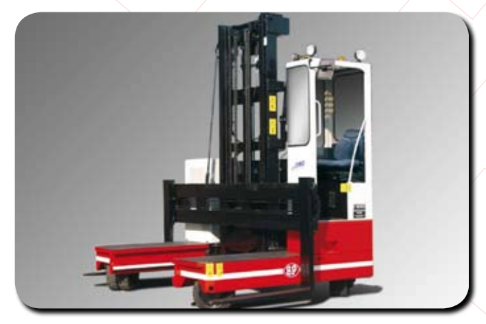
Multi-Directional Electric 2T to 4T

Modular design offers a premium product at cost effective pricing. Support various rear module mounted power plants (Electric - Diesel _ LPG)