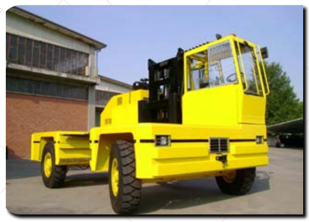
Custom Built Specials