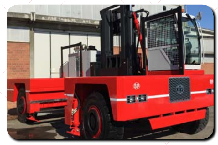
Power Shift Series

Customer specific design offers a product that endures long years of reliable service, with an instant pride in vehicle ownership.