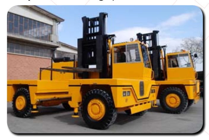
Worldwide Sales Network

Customer specific design offers a product that endures long years of reliable service, with an instant pride in vehicle ownership.