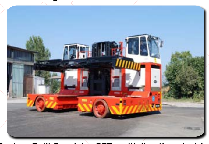
Custom Built Specials - 35T multi-direction electric