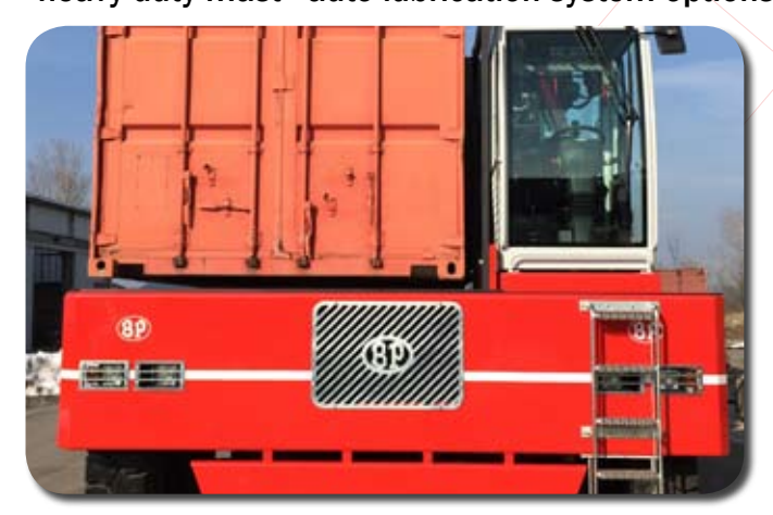
Diesel 4 T - 50T

Our large capacity range is based upon individual custom designs with Power Shift transmissions - heavy duty mast - auto lubrication system options