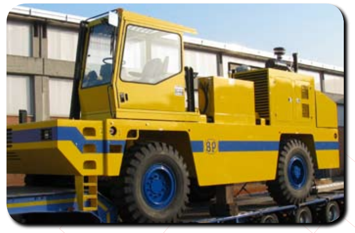
Variety of Load Handling Options