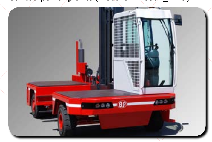
Diesel SLD Hydrostatic 3T to 7T

Modular design offers a premium product at cost effective pricing. Support various rear module mounted power plants (Electric - Diesel _ LPG)