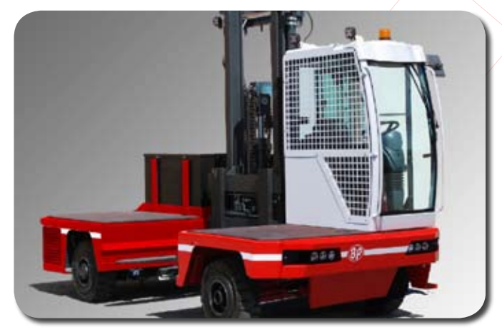
Electric SLE 2T to 7T

Our mid range series is based upon a modular design. Different axles and masts mount to standard heavy duty chassis.