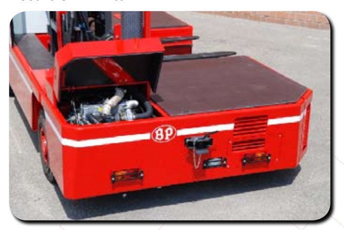
LPG SLL 3T to 7T